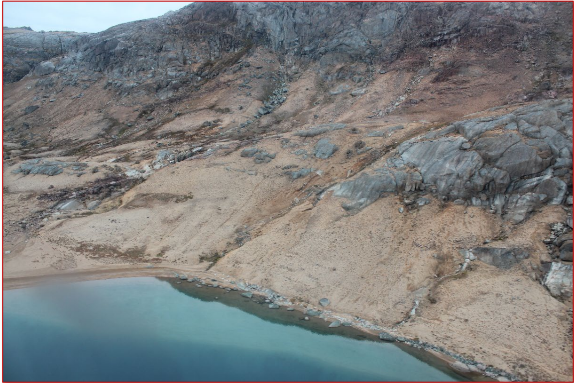
Figure 3: Colluvial and alluvial weathering accumulations from granitic country rock surrounding Blue Lake.