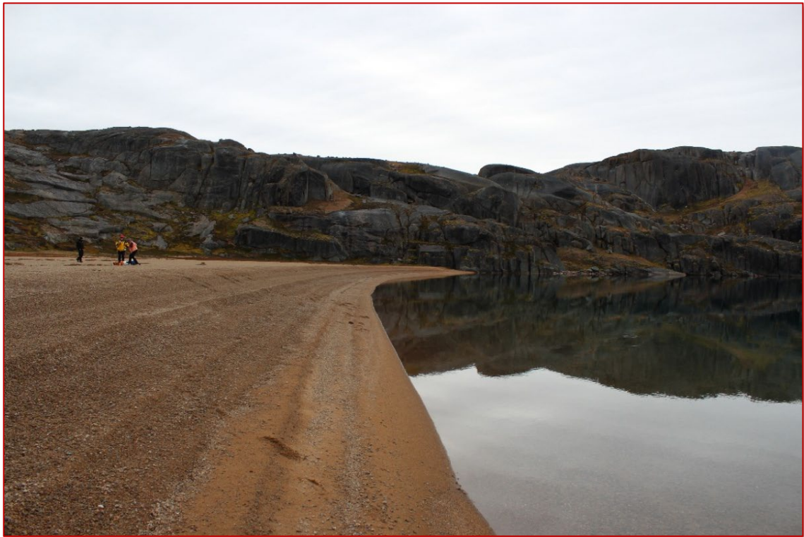
Figure 4: Coarse crystal rich 'beach' at Blue Lake.