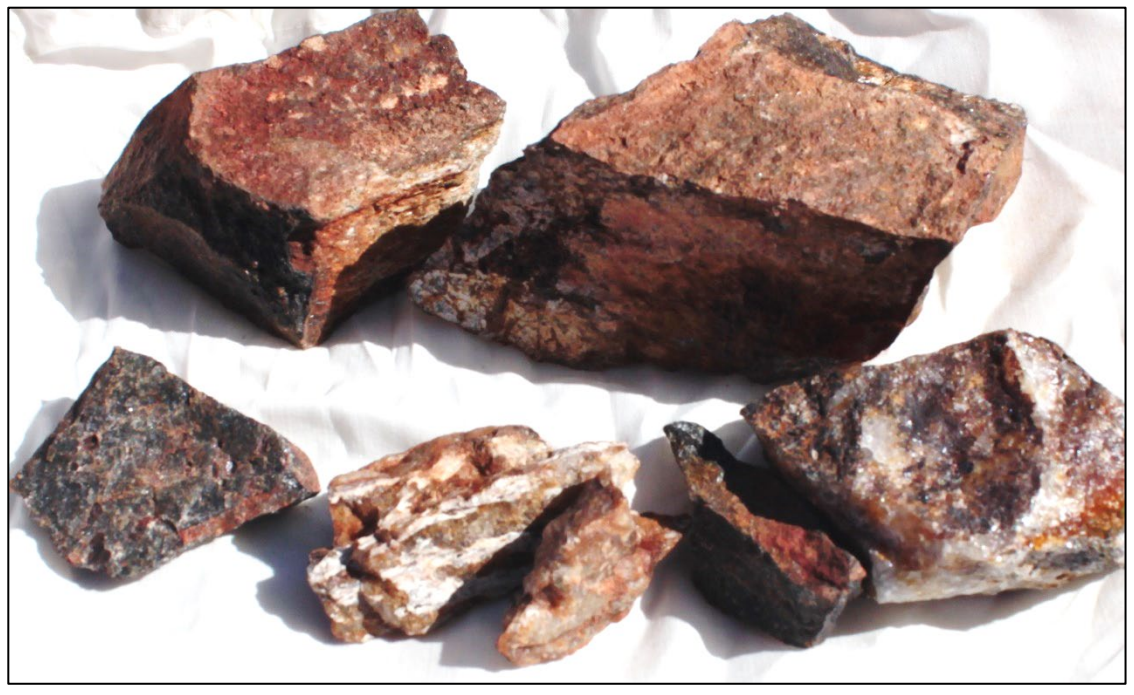
Figure 2: Photographs of mineralized rock samples containing combined quartz vein and silicified and iron oxiderich vein wall rock material . Above: Sample 230103_3 grading 5.52g/t Au. Below: Sample 230103_10 grading 1.42g/t Au.