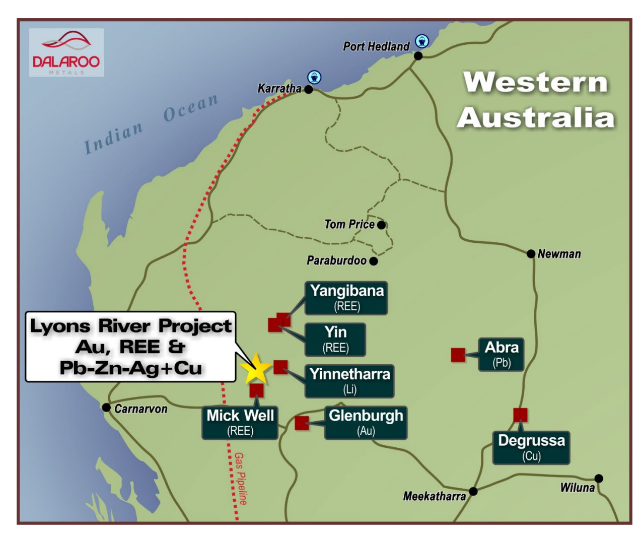
Figure 4: Lyons River Project location diagram

Lyons River is located approximately 1,100km north of Perth and approximately 220km to the north-east of the coastal town of Carnarvon, Western Australia. The Lyons River Project lies within the Mutherbukin Zone of the Gascoyne Province, which is the deformed and high-grade metamorphic core zone of the early Proterozioc Capricorn Orogen (Figure 4).