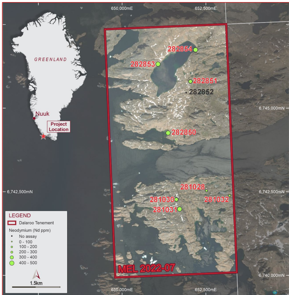
Figure 1: Project location, GEUS regional stream sediment location and neodymium assay results.

Dalaroo MD & CEO, Mike Brown commented “We are very excited to have secured this Option on the Blue Lagoon REE-Nb-Zr Project in Southwest Greenland. Regional stream sampling has indicated significant LREE anomalies and other critical metals that have both similar tenor to the geochemical footprint and geological setting of three other REE deposits in South Greenland. We see this as a strategic play on two levels; firstly, exposure to high demand commodities such as REE, niobium and zirconium and secondly, exposure to a highly prospective and unexplored jurisdiction that is getting significant attention with respect to the vital role Greenland could play in providing critical metals in the future. With the Project being located on the coast with ice free water we are looking forward to getting onto the ground to commence exploration activities.”