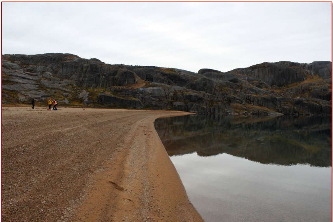
Figure 5: Coarse crystal rich 'beach' at Blue Lake.